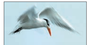
A tern looks for dinner.

Besides the birds that flock to the center, two resident alligators call the place home. Boots is the larger of the two, and Bags is the smaller alligator with a missing eye. They appear to live