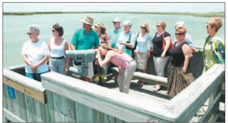
Birders gather on the boardwalk at the Leonabelle Turnbull Birding Center in Port Aransas.

Weekly guided nature tours, called Birding on the Boardwalk,