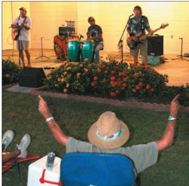
A music lover gives Triggerfish some help during a Sunset Sounds concert.