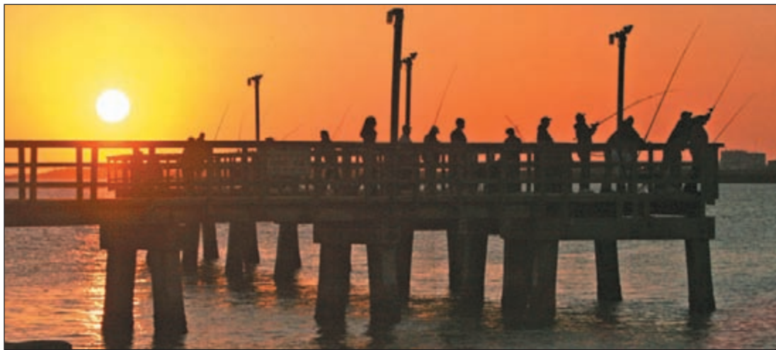
Anglers cast their lines at sunset from the J.P. Luby Pier in Roberts Point Park.

dolphin watchers to pass the time in Port Aransas.