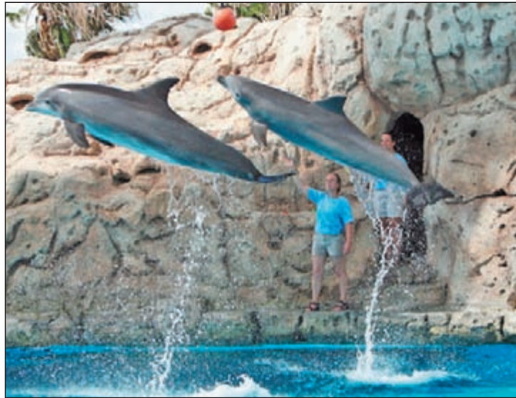
Dolphins perform at the Texas State Aquarium.

The aquarium also offers visitors the opportunity for a unique experience by living the life of a dolphin trainer. This