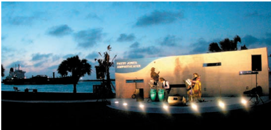
Passing ships and sunsets are the backdrop to Sunset Sounds, a series of free outdoor concerts held in Roberts Point Park at the Patsy Jones Amphitheater overlooking the Corpus Christi Ship Channel. The concerts, sponsored by the Port Aransas Parks and Recreation Department, are held the second Friday of the month from April through October.