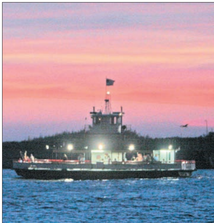
A converted ferryboat, now a charter fishing boat, cruises by Sunset Sounds as passengers fish to the music.

Tourists, oldies and surf music on July 10; Riverwalk Ramblers, old-time folk music on Aug. 14; Victims of Circumstance, rock, on Sept. 11; and Cody Angel and Friends, variety, on Oct. 9.