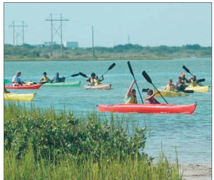
Kayakers set out for one of many trails available around the island.