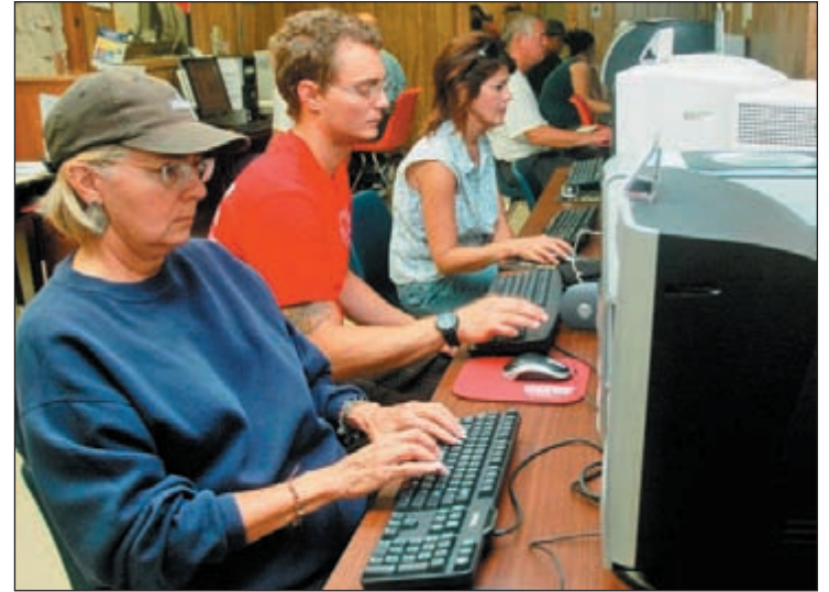
Residents and visitors enjoy the Port Aransas Computer Center.

Several experienced computer center board members offer individual instruction and set-up help for laptop users. For a $10 (one hour) or $15 (2 hour) contribution, the board member will